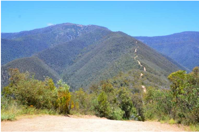
Start of Billy Goat Bluff Track to top of range