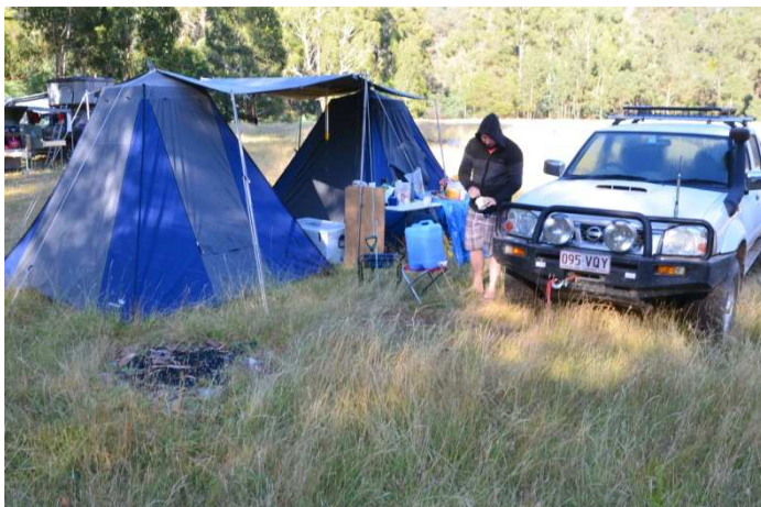
The Hass 5 Star Camping Accommodation

Many club members have been asked to provide some details of how they spent this time, but in the absence of any response, readers will have to be happy with a photo or two from my trip to the Victorian Alps.