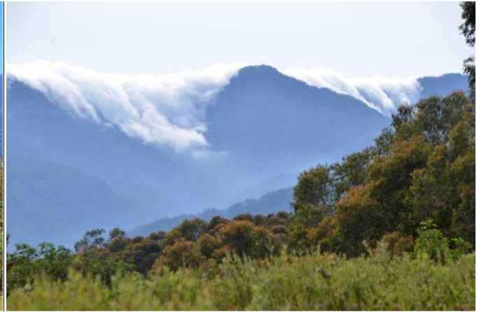
Clouds rolling in and over Victorian Alps